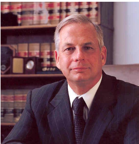
Congressman Gene Green 29 th District

There will be scholarship drawings offered by participating local colleges and organizations. Students must be a senior and present to win. Information will also be available about the nomination process to the U.S. Military Service Academies.