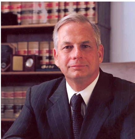
El Diputado Gene Green Distrito 29

Habrá becas ofrecidas por las universidades locales y organizaciones. El estudiante debe estar presente para ganar y para en el 12 grado. Información también estará a disponible sobre el proceso de nominación a las academias de servicio militar de los Estados Unidos.